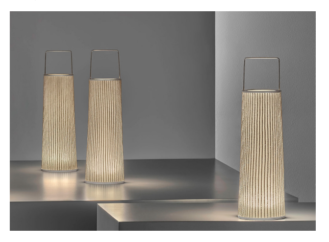
Gea. Taking its name from the primordial goddess of the earth, Gea celebrates the beauty and resilience of nature. Designed by Arturo Álvarez, each luminaire from the Gea collection represents the timeless elegance of the natural world, with stylised forms reminiscent of upright female figures. Crafted from painted stainless steel mesh, Gea exudes ethereal beauty, adding organic sophistication to any interior space. Whether as a wall lamp or floor lamp, Gea transforms spaces into sanctuaries of serenity and grace. an ethereal ambiance.